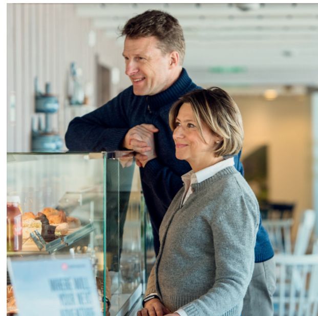
MULTE BAKERY & ICE CREAM