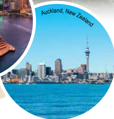
Auckland, New Zealand