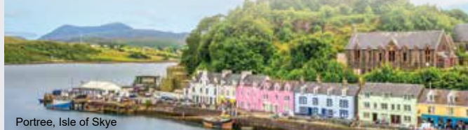
Portree, Isle of Skye

Prices and availability are based on 19 th June 2021 departure and ports of call vary on other date