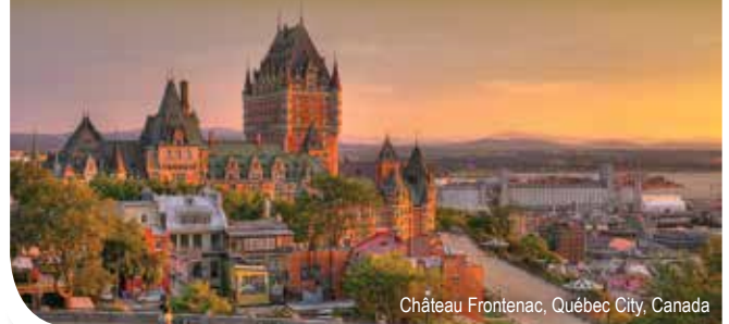
Château Frontenac, Québec City, Canada

With its busy restaurants, artisan shops and family-run bakeries, this delightful area is full of character and atmosphere. The grand Château Frontenac dates back to the 19 th century and is the star of the city skyline, a visit here for afternoon tea makes the perfect end to a day ashore.