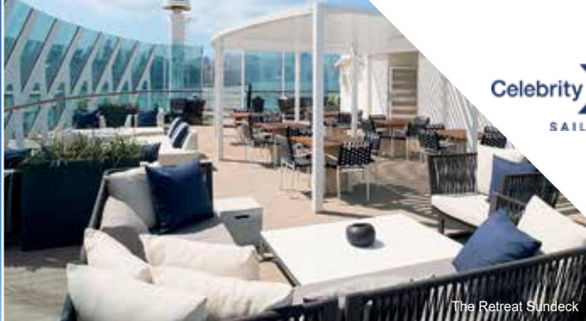
The Retreat Sundeck