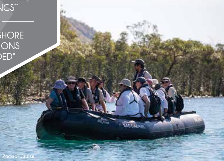
Zodiac ® Cruise

Marine biologists, historians and other experts present background lectures and slide presentations to give you a deeper insight into the exciting adventures you'll experience.