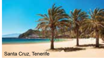
Santa Cruz, Tenerife