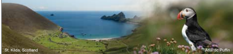
St. Kilda, Scotland