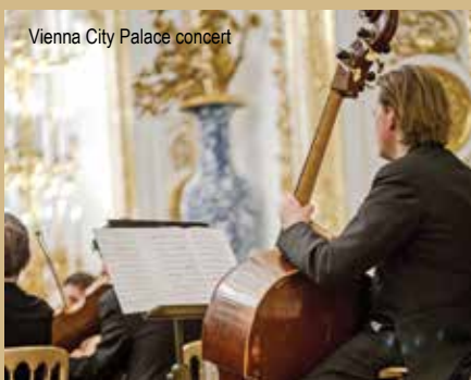
Vienna City Palace concert