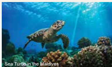
Sea Turtle in the Maldives

Set sail on this beautiful discovery of the Indian Ocean, complete with overnight stays in Cape Town, Malé and Singapore. This itinerary will take you on the most fascinating journey of the Indian Ocean.