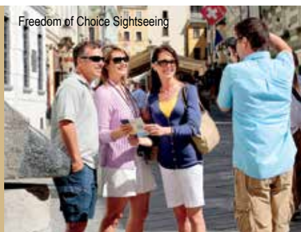
Freedom of Choice Sightseeing