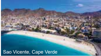
Sao Vicente, Cape Verde