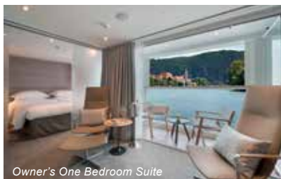
Owner's One Bedroom Suite

From the striking three-tiered atrium that greets you in reception to the surprising innovations you won't find on other river cruise lines, Emerald Waterways' luxury river cruise ships bring the highlights of ocean cruising to the intimacy of Europe's waterways.