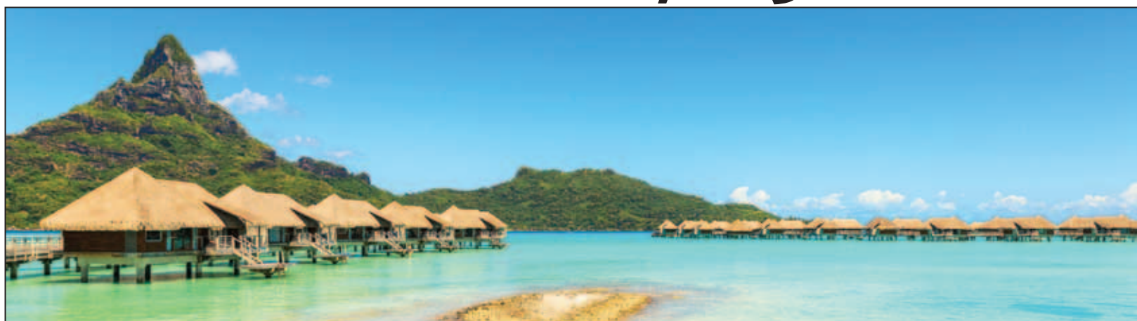
Clockwise from above: Bora Bora, French Polynesia; Victoria Harbour, Hong Kong; Golden Gate Bridge, San Francisco

Your grand world voyage begins on Sunday 7th January 2018, when you join the majestic Queen Elizabeth in Southampton and cross the Atlantic, in search of Bermuda, the USA and Caribbean. Your first port of call is a maiden one as Queen Elizabeth pulls into vibrant Hamilton on the island of Bermuda. Upon arrival, you'll immediately notice Front Street, which runs along the shore and is home to a multitude of shops, restaurants and bars – all benefiting from incredible views out across the harbour. Vibrancy is also in abundance in the dramatic city of New York – where you'll enjoy an overnight stay to experience all that the Big Apple has to offer. From the bright lights of Broadway, to the legendary Central Park and amazing shopping opportunities, you'll be spoilt for choice during your time here. Next up, the sun-kissed beaches of Fort Lauderdale will grab your attention, before you continue topping up your tan in Ocho Rios, Jamaica. White sand Turtle Beach arcs around a scenic bay, while Mahogany Beach has a small reef, where you can snorkel, should you wish. This maiden port is sure to provide you with countless memories.