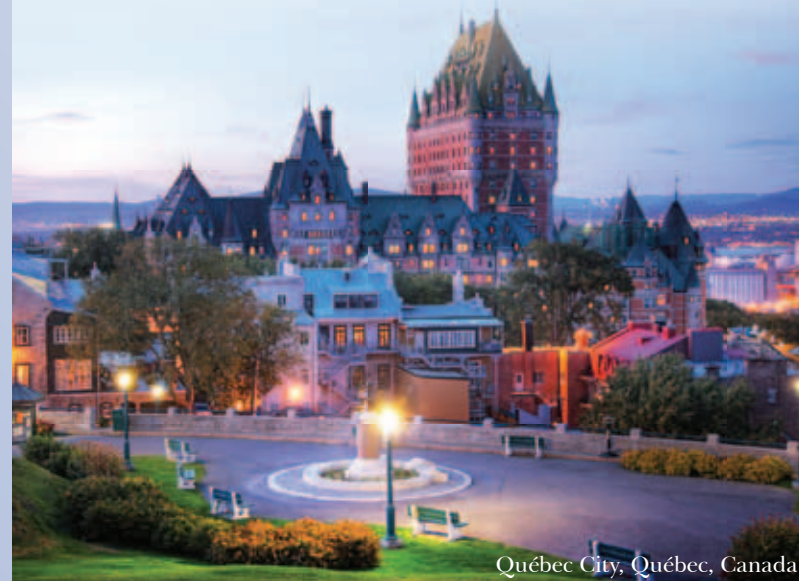
Québec City, Québec, Canada

Québec today is a haven for culture and the arts with 37 National Historic Sites of Canada, numerous museums, theatres and beautiful examples of early Canadian architecture with the most famous being the legendary Château Frontenac