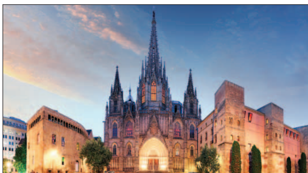
Clockwise from above: Monte Carlo, Monaco; Côte d'Azur; Cádiz, Spain; Cathedral in Barcelona, Spain

Lisbon for your first port of call, you will undoubtedly share the anticipation these sailors experienced as they ventured into new and exciting lands for the first time. This beautiful city mingles winding streets with spacious squares, ancient castles and a medieval quarter - not only this, but Gothic cathedrals, majestic monasteries and museums all make up the colourful cityscape, but you'll find the real wonders as you explore the backstreets.