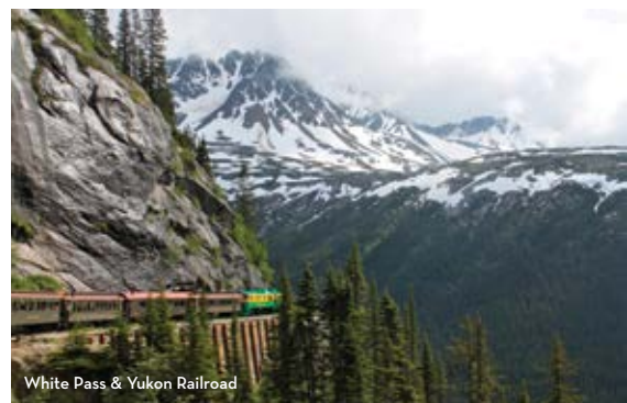
White Pass & Yukon Railroad

-Y3 does not include Glacier Bay when taking cruise first option