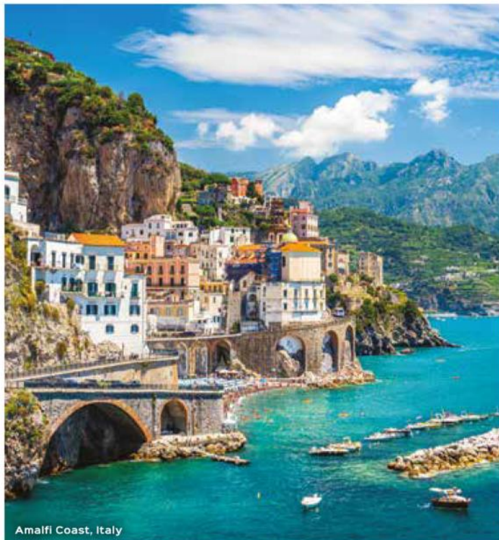
Amalfi Coast, Italy