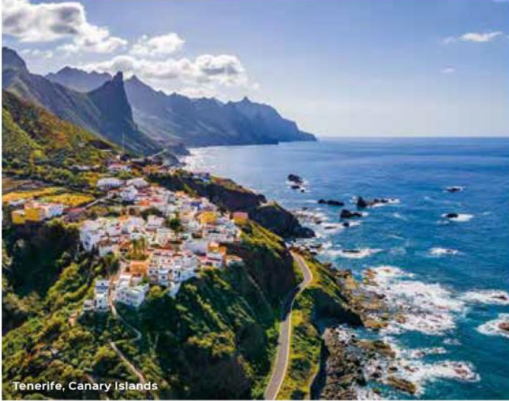
Tenerife, Canary Islands