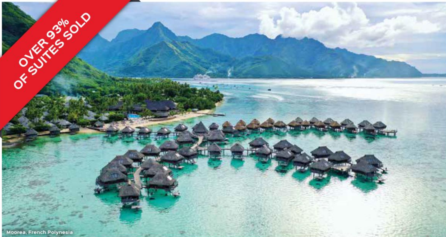
Moorea, French Polynesia