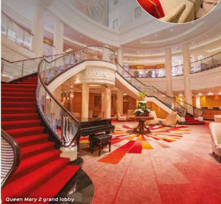
Queen Mary 2 grand lobby