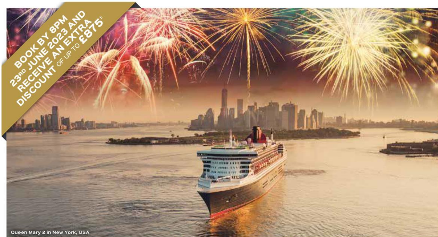
Queen Mary 2 in New York, USA