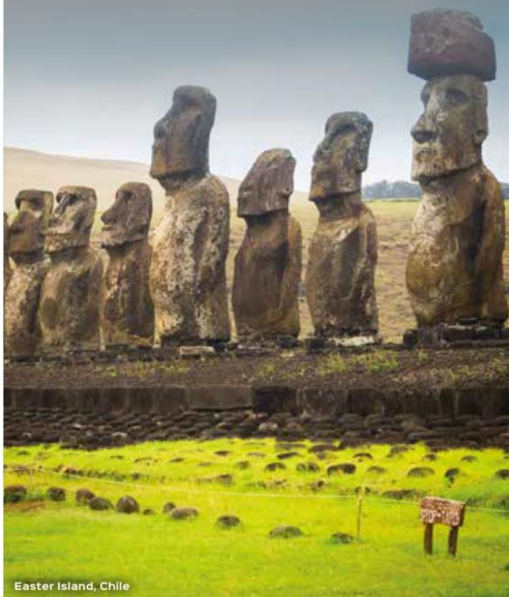
Easter Island, Chile

Just south of the Tropic of Capricorn, Easter Island, or Rapa Nui, lies 3,790 kilometres to the west of Chile. Extraordinarily remote, this island was first inhabited by Polynesians about 1,200 years ago. The island is best known as the site of more than 600 stone statues, or moai, which stand up to nine metres in height. The statues were carved in the spectacular Rano Raraku quarry and were then believed to have been transported on wooden rollers to their destinations.