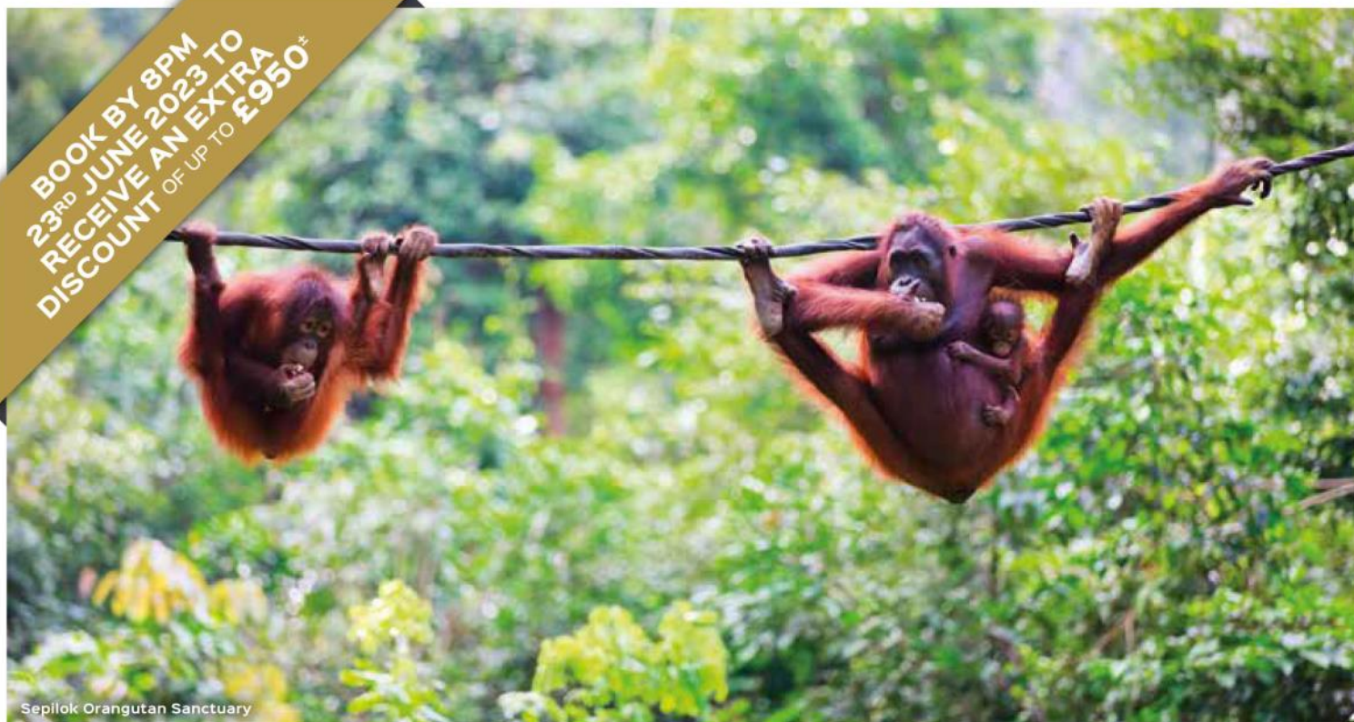
Sepilok Orangutan Sanctuary

BOOK BY 8PM 23 RD JUNE 2023 TO RECEIVE AN EXTRA DISCOUNT OF UP TO £950*