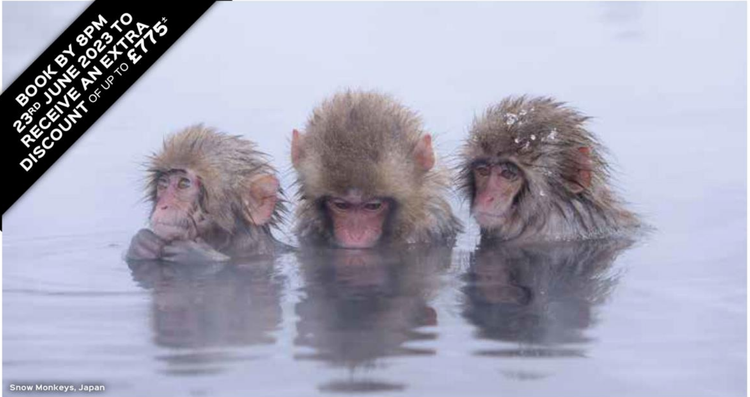
Snow Monkeys, Japan

BOOK BY 8PM 23 RD JUNE 2023 TO RECEIVE AN EXTRA DISCOUNT OF UP TO £775*