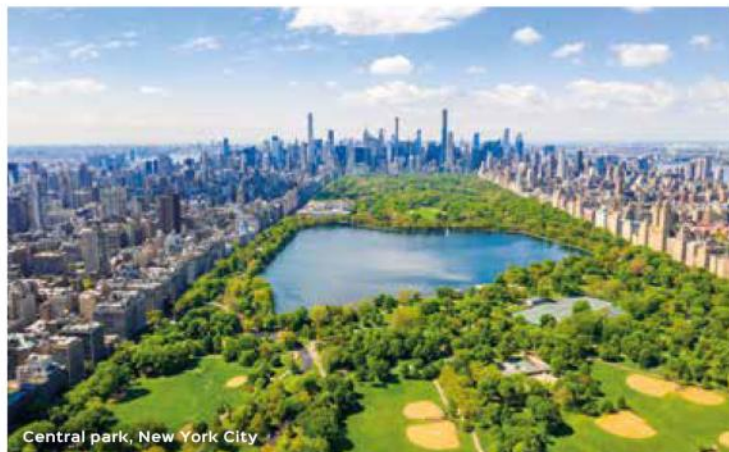
Central park, New York City

Dates not mentioned are spent relaxing at sea