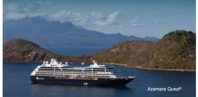
Azamara Quest ®