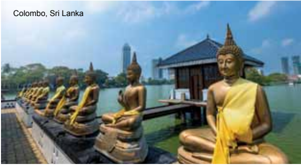
Colombo, Sri Lanka

This teardrop-shaped island gem offers engaging encounters both in the capital city and the surrounding countryside. Wind your way through the streets of Colombo's old quarter to find some world-famous tea and explore eclectic cafés and shops, or trek out into the jungle in search of the majestic Asian elephant