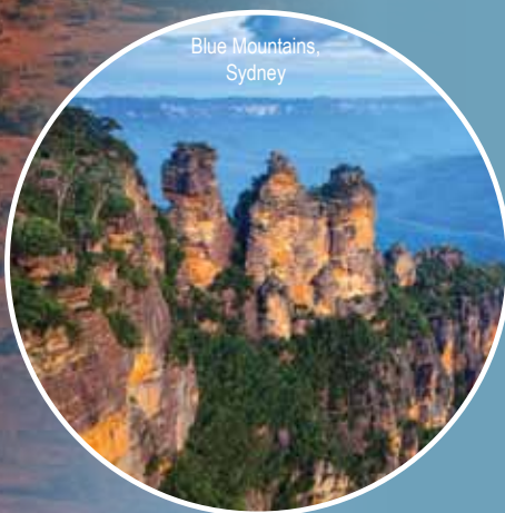
Blue Mountains, Sydney