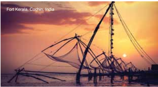
Fort Kerala, Cochin, India

The mixture of cultures and influences in Cochin – from giant Chinese fishing nets at Fort Kochi and a 400 year old synagogue to ancient mosques and Portuguese-style homes – is a reminder of the city's history as the former centre of the Indian spice trade.