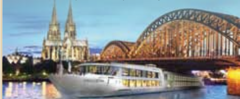
Emerald Waterways cruise ship in Cologne

FREE UNLIMITED DRINKS PACKAGE FOR ALL BALCONY SUITES & ABOVE ++