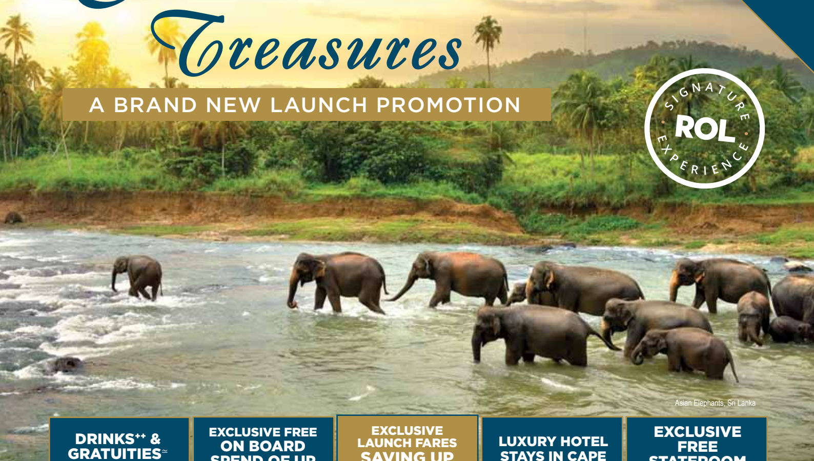
Asian Elephants, Sri Lanka