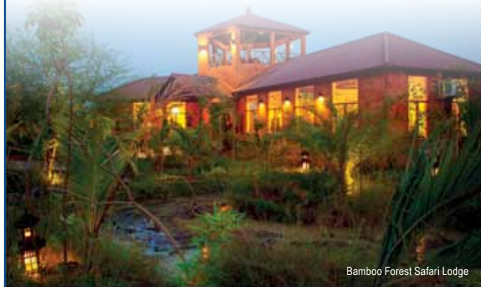
Bamboo Forest Safari Lodge

Sample the incredible gourmet cuisine at the Bamboo Forest Safari Lodge. Your stay includes three breakfasts, two lunches and three dinners served by chefs that have already earned a respectable name in the world of gastronomy