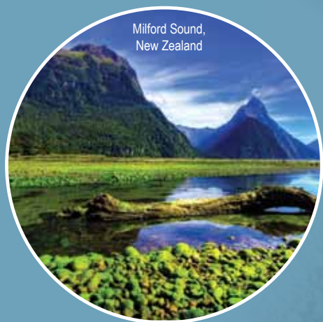
Milford Sound, New Zealand