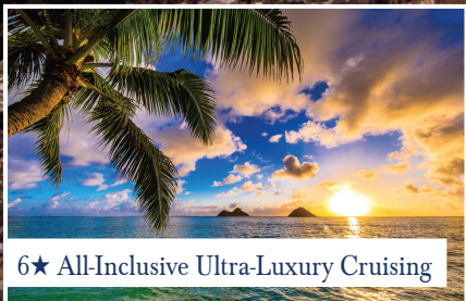
6★ All-Inclusive Ultra-Luxury Cruising

WWW.ROLCRUISE.CO.UK/SIGNATURE-COLLECTION