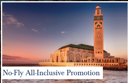
No-Fly All-Inclusive Promotion