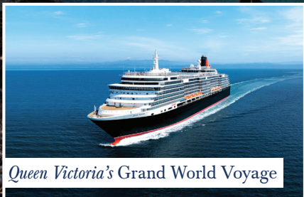
Queen Victoria's Grand World Voyage