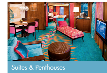
Suites & Penthouses S1 S2 S3 S4 S5 SC SE SF M1 MA MB MX

*Nominal cover charge and à la carte pricing applicable