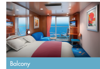
Balcony B1 B2 B3 BA BB BC BD BX