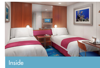
Inside I1 IA IB IE IC ID IF IX