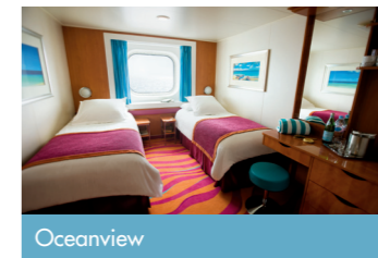
Oceanview O1 OA OB OC OF OG OK